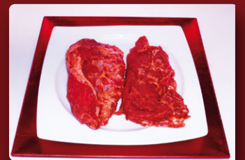
Pluma Ibérica Adobada